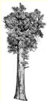
Coast Redwood can be as tall as 370 feet!

The California redwoods: the Coast Redwood ( Sequoia sempervirens ) and the Giant Sequoia ( Sequoiadendron giganteum ) are the tallest and largest living organisms in the world!